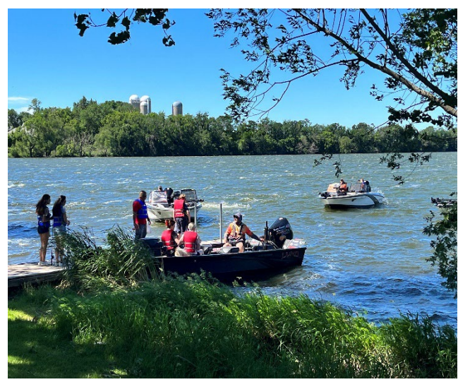
Safe Kids Fargo-Moorhead partners with coalition member, Fargo Police Department, to provide an open water and boating safety educational session at a local lake.

Safe Kids Fargo-Moorhead had the opportunity to represent Sanford Children's Hospital at the Downtown Fargo Street Fair. The fair was an excellent awareness raising opportunity as many different population groups and communities gathered throughout the weekend. The coalition was able to interact with thousands of people, educating them on open water and boating safety and providing coloring sheets with water safety information to the children.