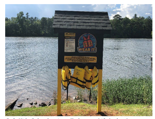
Safe Kids Columbus installed a new Life Jacket Loaner Station in July at Blanton Creek

In July 2022, Safe Kids Columbus installed it's seventh loaner station at Blanton Creek in Georgia. They also distrubuted 85 life jackets through it's loaner stations. Additionally, their River Safety Committee met on July 18th and the mayor asked the Committee to provide an update on open water safety in the area to the city council. The Committee meeting was recorded and televised on YouTube and the local government channel. The Committee proceeded to update the Georgia City City Council on July 26<sup>th</sup> and that presentation was also made available on YouTube.