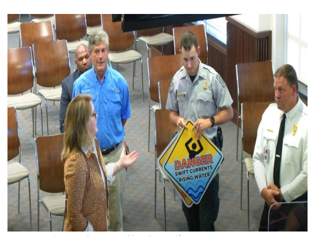
Presentation to Georgia City Council