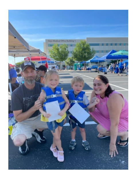
Safe Kids Austin (TX) hosts Summer Safety Fest in the city of Kyle. The event provided open water and boating safety information to families as well as life jackets, in addition to other summer safety topics.